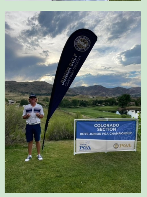
2022 Drive, Chip, and Putt