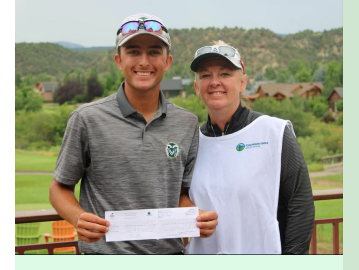
86th CGA Amateur Championship Leaderboard